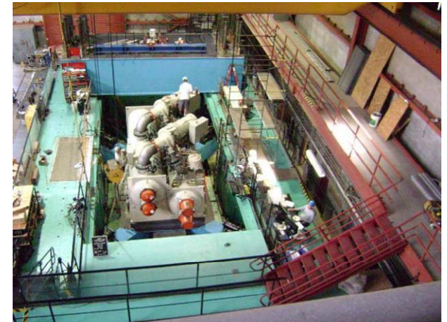
WDC 126 at UC San Diego