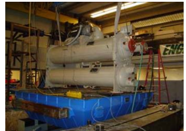
WMC 145S at Portland State